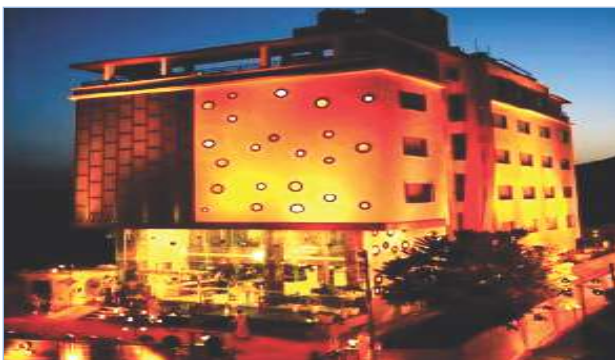
Q Hotel, Fatehpura