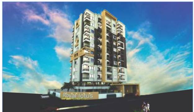
Royal Lotus, Opp. St. Marys School, Titardi