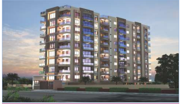
Royal Imperial, Navratan Complex