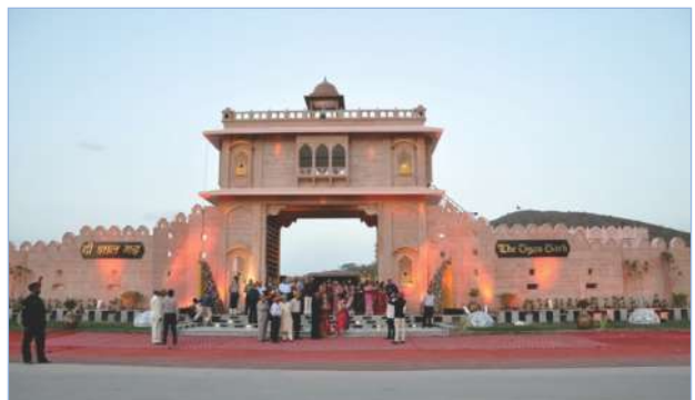
The Gyan Garh, Navratan Complex