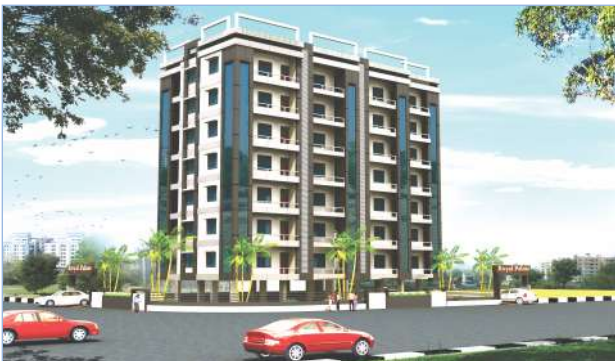
Royal Palms, Navratan Complex