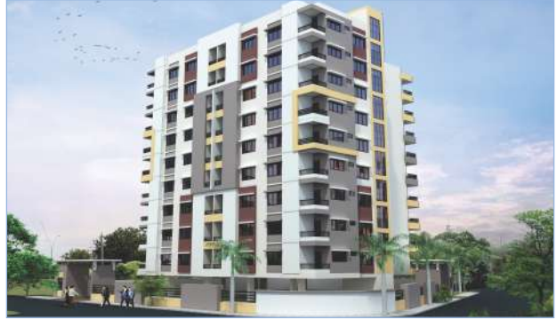
Royal Pine, Sukher, Kota Bawdi