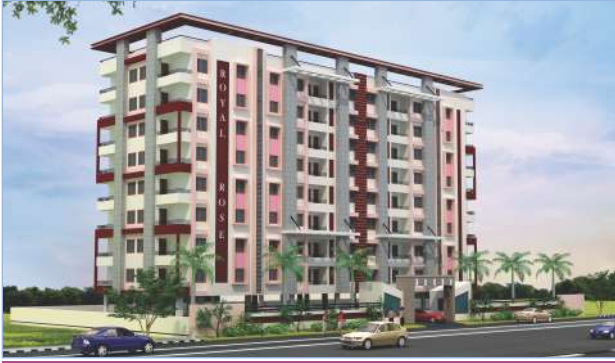
Royal Rose, Navratan Complex