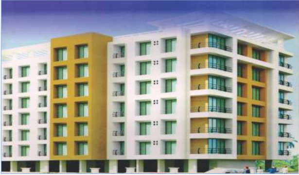
Royal Tulip, Navratan Complex