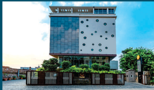
Hotel Zone Connect By The Park, Fatehpura