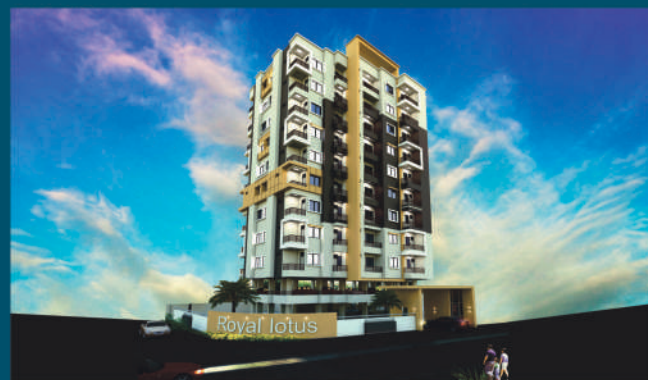
Royal Lotus, Opp. St. Marys School, Titardi