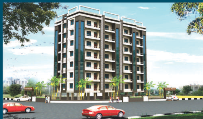
Royal Palms, Navratan Complex