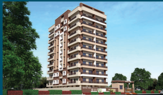
Roayl Pine, Bhuwana