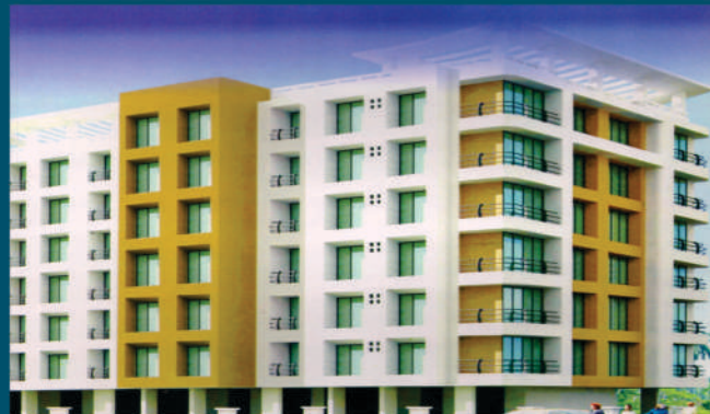
Royal Tulip, Navratan Complex