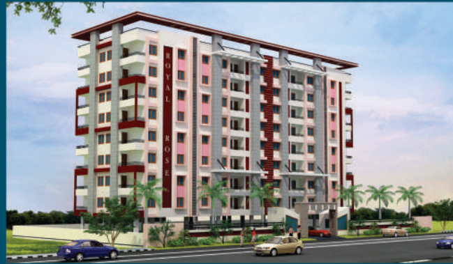
Royal Rose, Navratan Complex