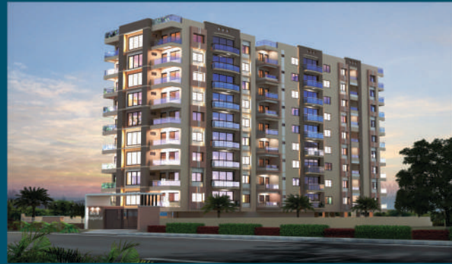
Royal Imperial, Navratan Complex