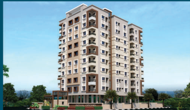
Royal Orchid, Transport Nagar